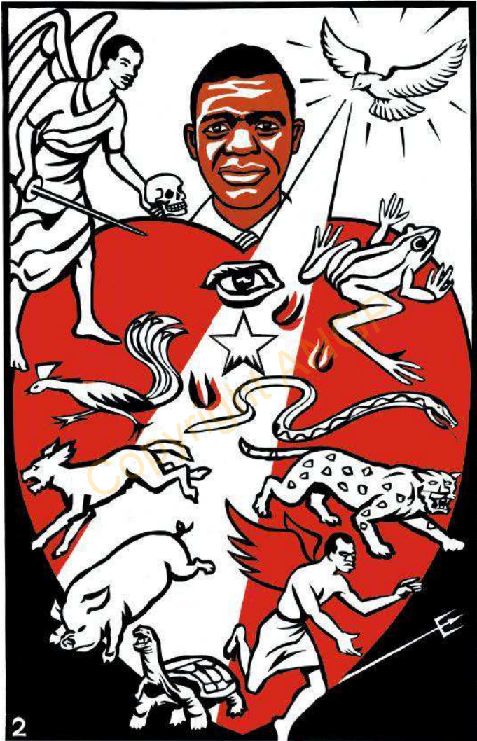
2. THE HEART CONVINCED OF SIN.