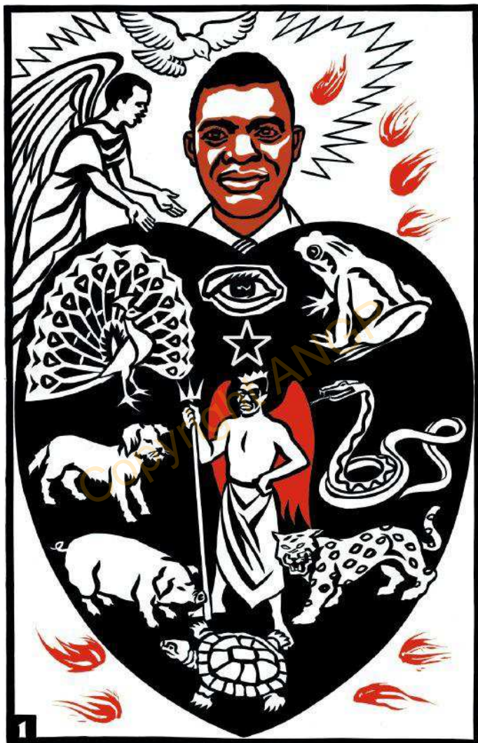
1. THE SINNER'S HEART.