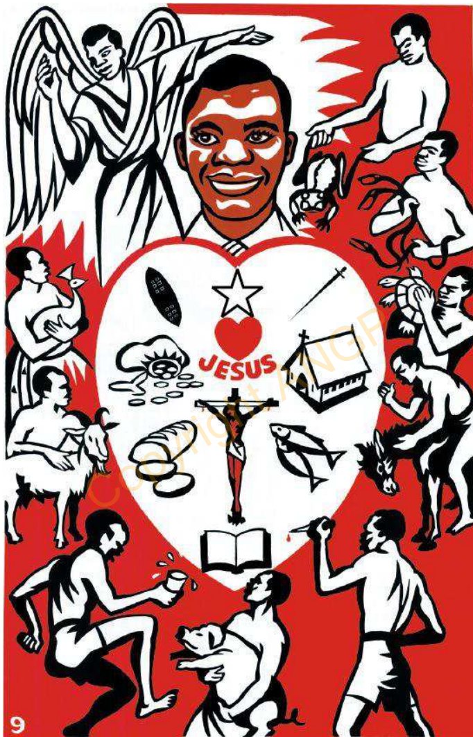
9. THE VICTORIOUS HEART.