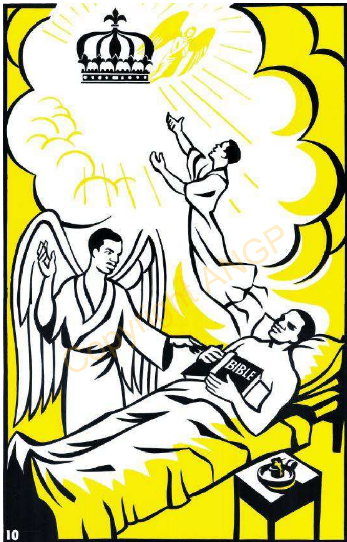
10. THE GLORIOUS HOMOING.