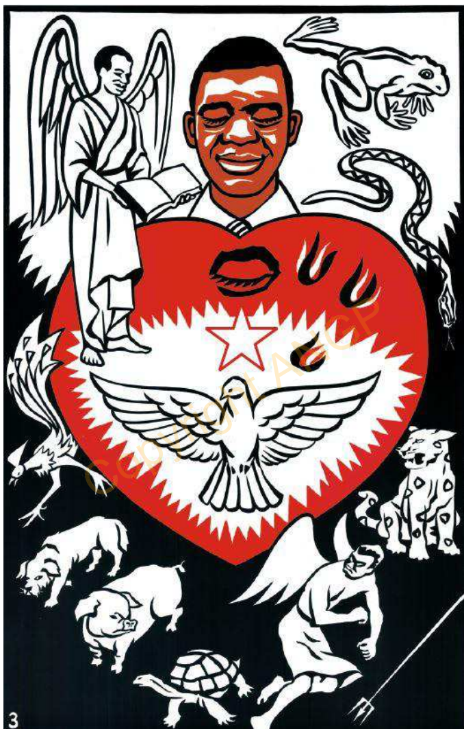
3. THE REPENTING HEART.