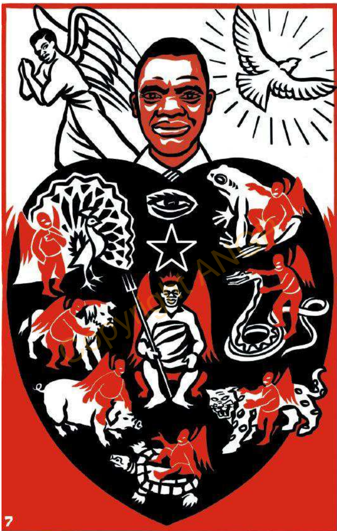
7. BETIDA WOY SHUCHCHA WOZINAA