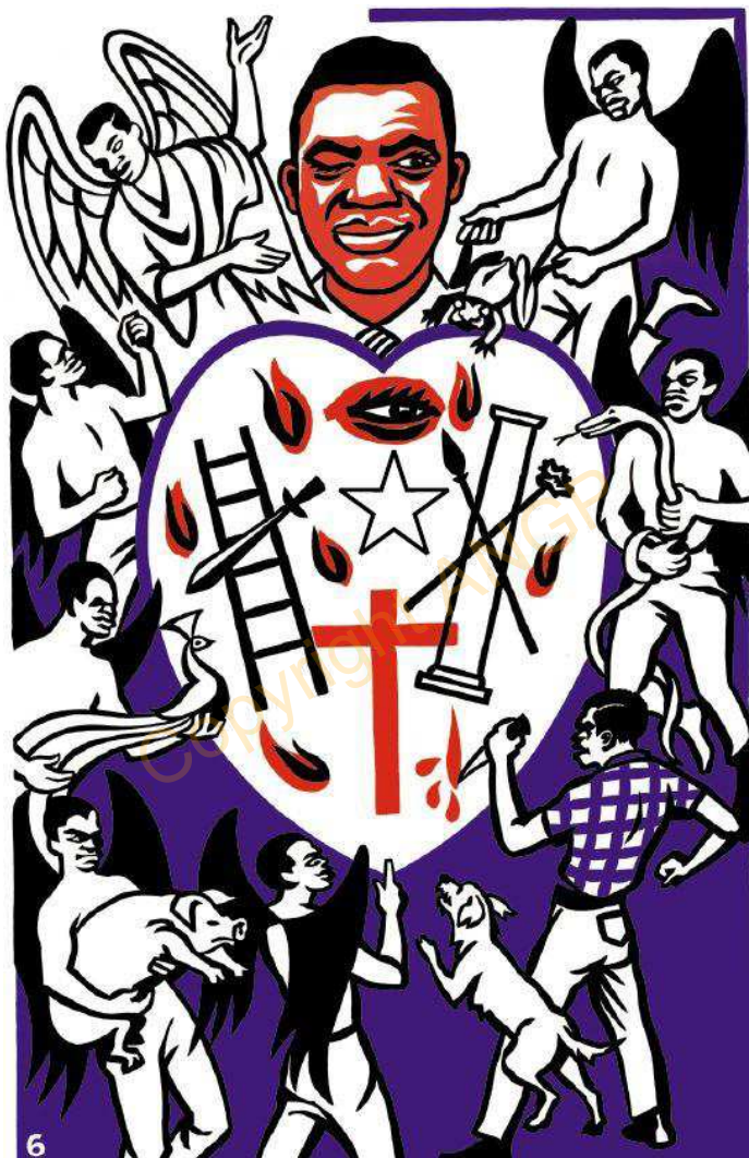
6. PAACES INJJATIDANNE QONCCIDA WOZINA