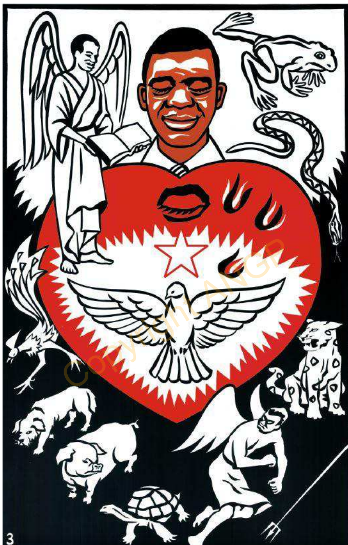
3. MUTJIMA GWA ZURA RUHODI, A GU LI-VERE