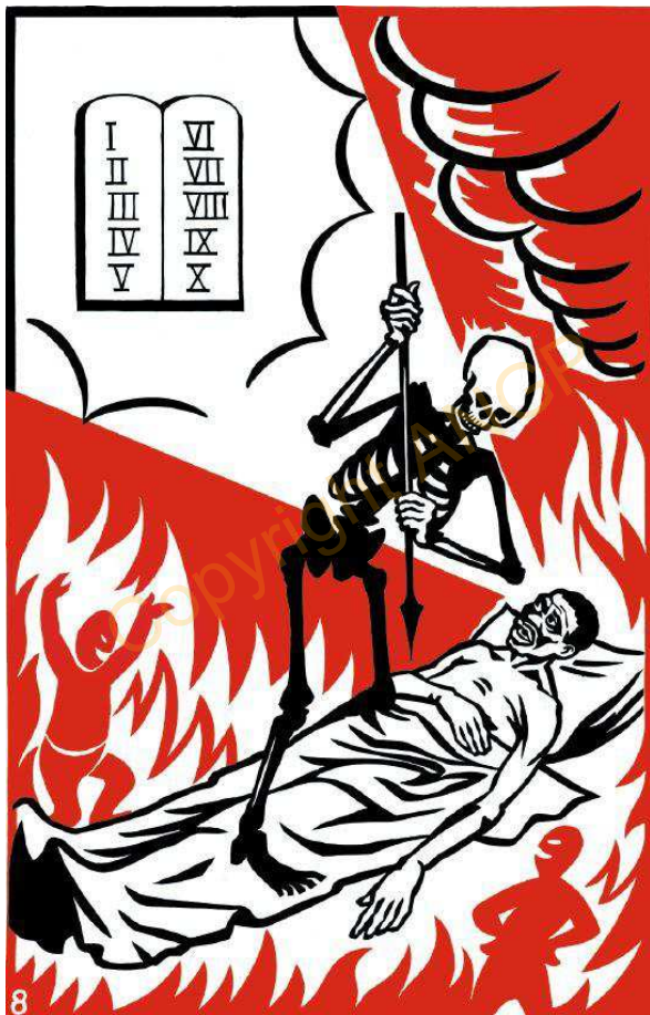
8. EKANO LOMULUNDE

nhele yokukala mouyelele, kape na vali etumwaumbwile lasha kombinga yoye, kape na ekwafo lasha, osheshi paife owa hoolola efyo komesho yomwenyo—“osheshi ondjabi youlunde oyo efyo.” Ovaroma 6:23.