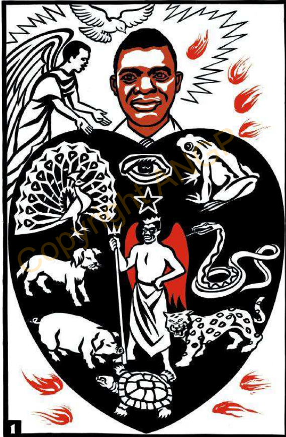
1. OMUTIMA WOMUNAMATIMBA

Fiyo onena Jesus ota shiivifa eshivo laye: “Ileni kuAme, nye amushe hamu longo nomwa lolokifwa, Ame ohandi mu pe etulumuko. Litwikeni ondjoko yange nye mu lilonge kuAme, osheshi Aame omunambili nomomotima onde lininipika; ndee tamu monene eemwenyo deni etulumuko.” Mat. 11: 28,29.