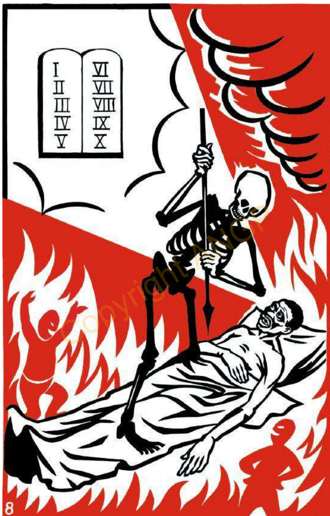
8. Fubēhtia kuum