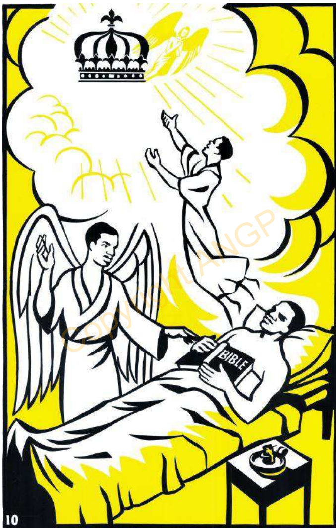
10. Izeni mweye nbaligigwe na Tatiyangu Mat. 25:34