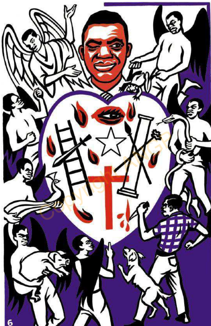
6. Koto ak mukuley nye chwayat