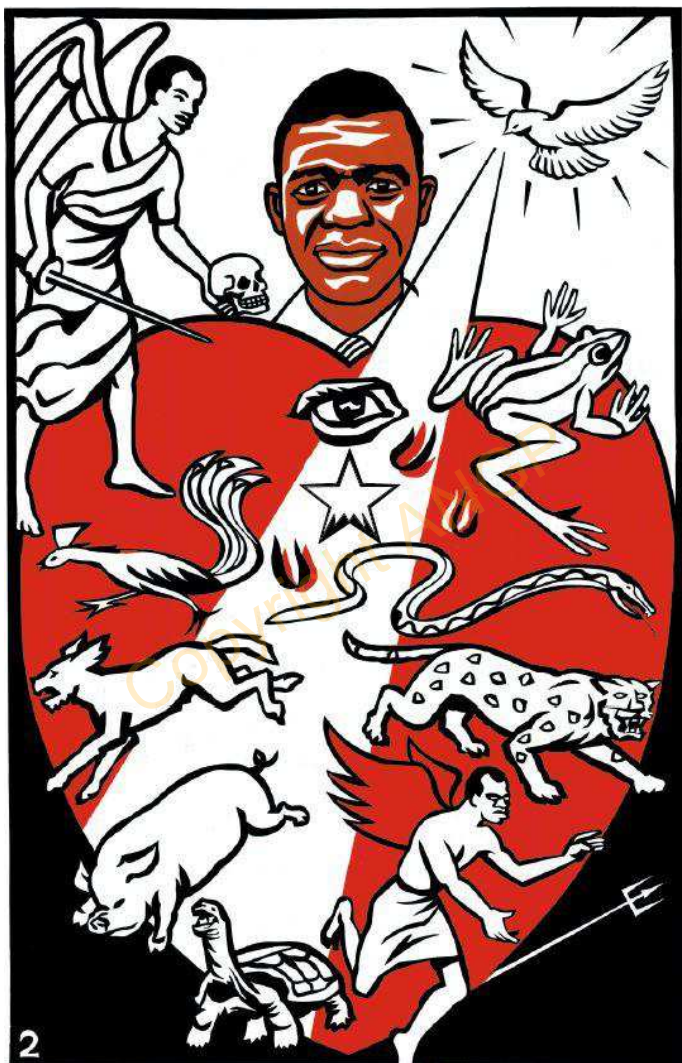
2. Mukuletyo nyeberekurenykey