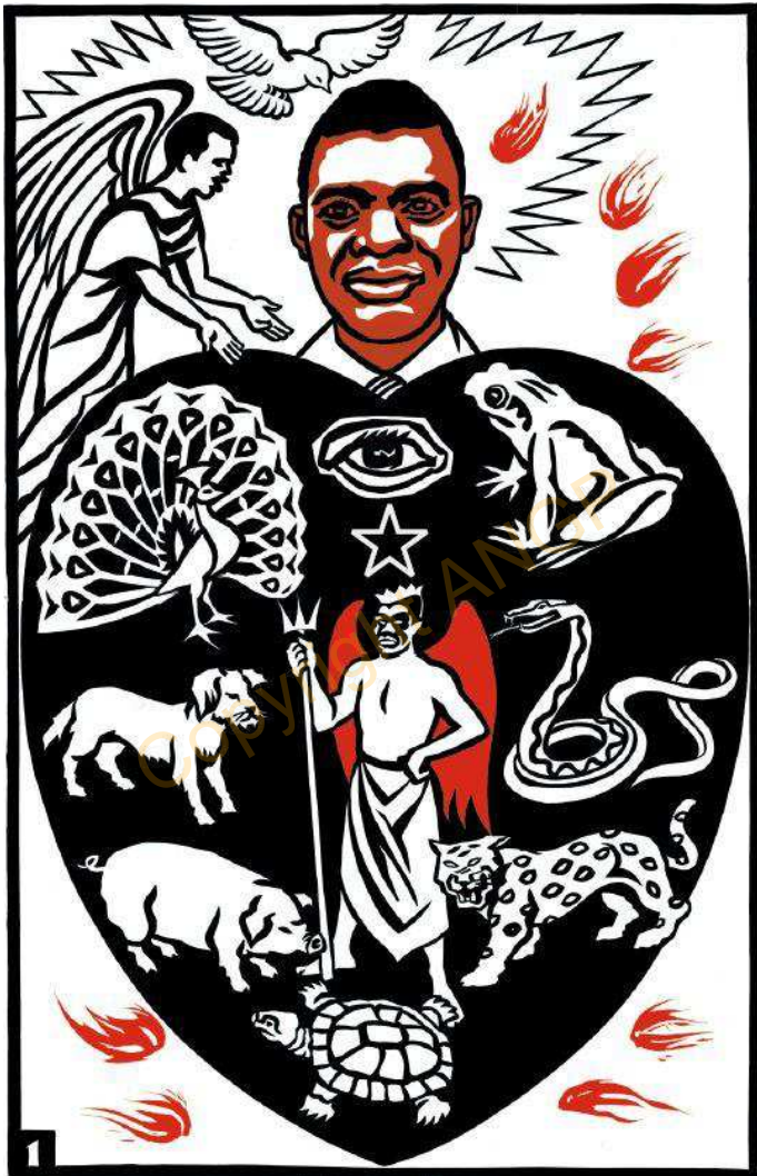
1. Mukuletyab Kanyorintet