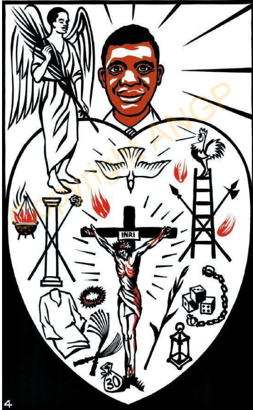
4. Met ako Kristo

Kyoboku nte Sobon ng'wong' Kikeunye wule Mi Kristo orit ab Anietet. Kol. 3:3