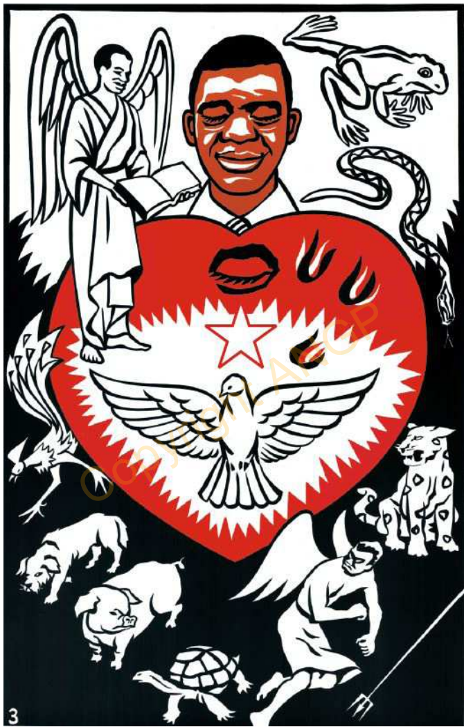
3. MWOYO KWIKANILANGA