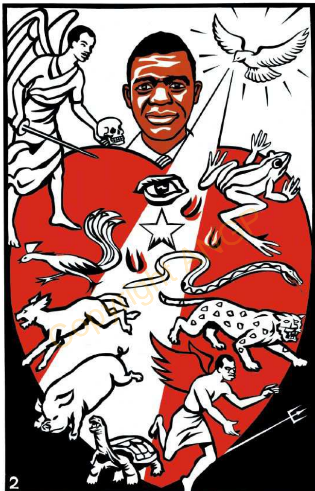
2. MWOYO KUMALI KHUKHALAJILWA NA KUVUJILILANGA LIKHALAKA.