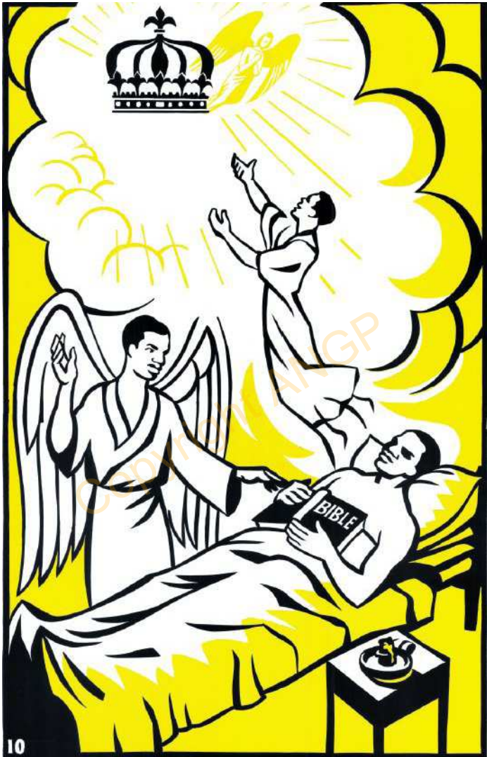
10. WINGILA MU KIFUMU KIA NZAMBI