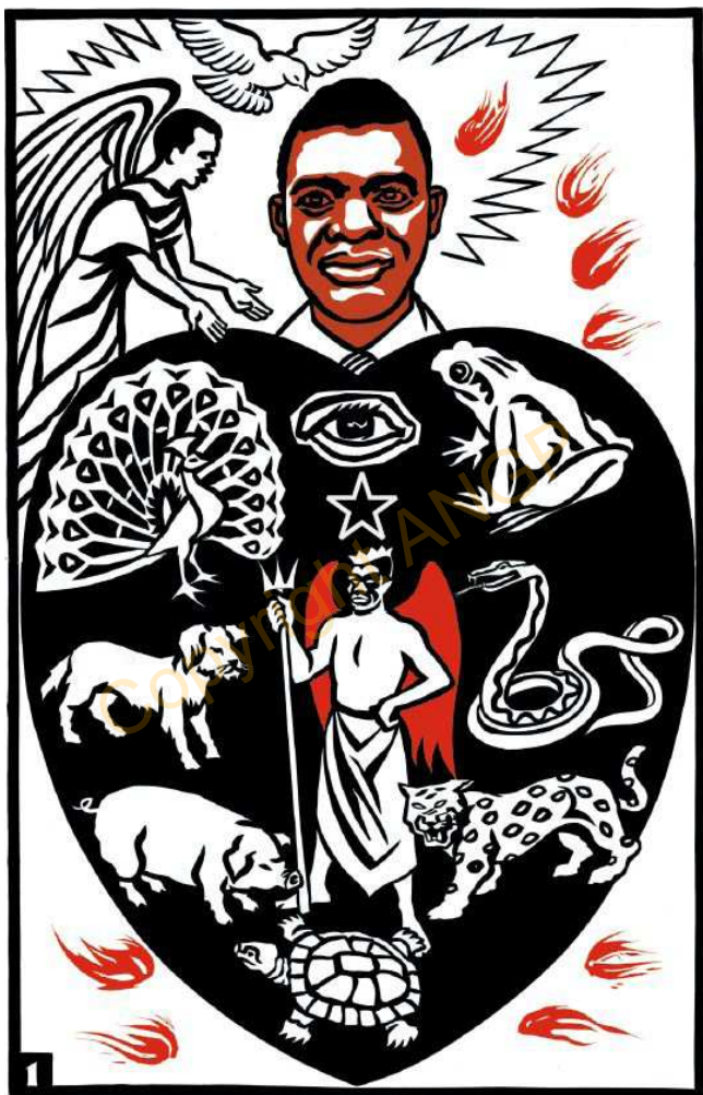
1. MUTSHIMA WA MUKWA MASUMU