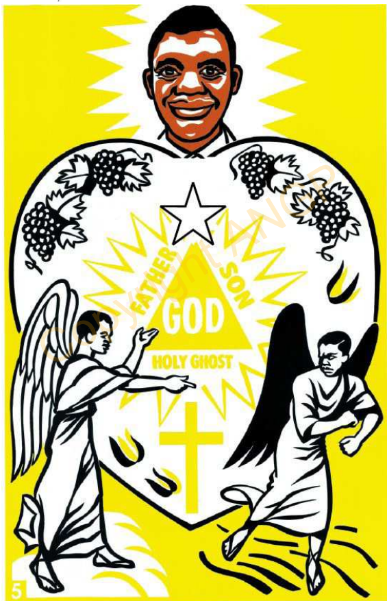
5. KIDDIN GA JOMÉ GA KUMU KAI

BUŞU ERÉ GO GEDDANG TOGÉ PIUÉ MALGÉ WOLÉ KGIN